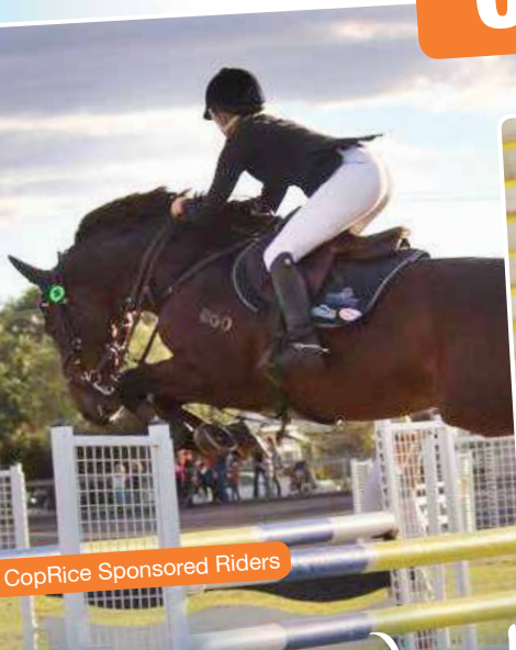
CopRice Sponsored Riders